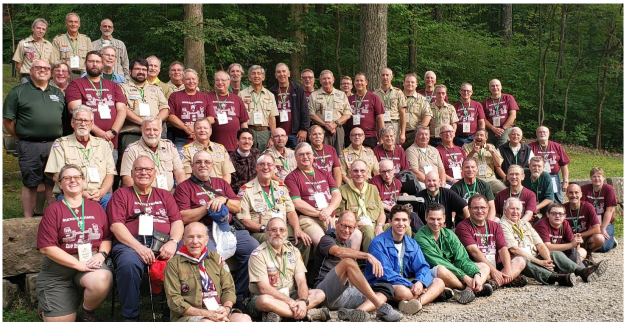
Camp Tuscazoar Staff Alumni Reunion – Dover, Ohio

Helping You Organize a Successful Reunion!